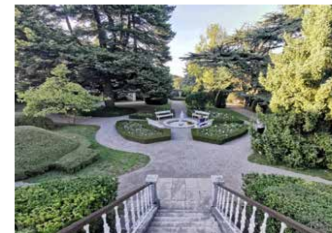
Sežana – Botanical Park