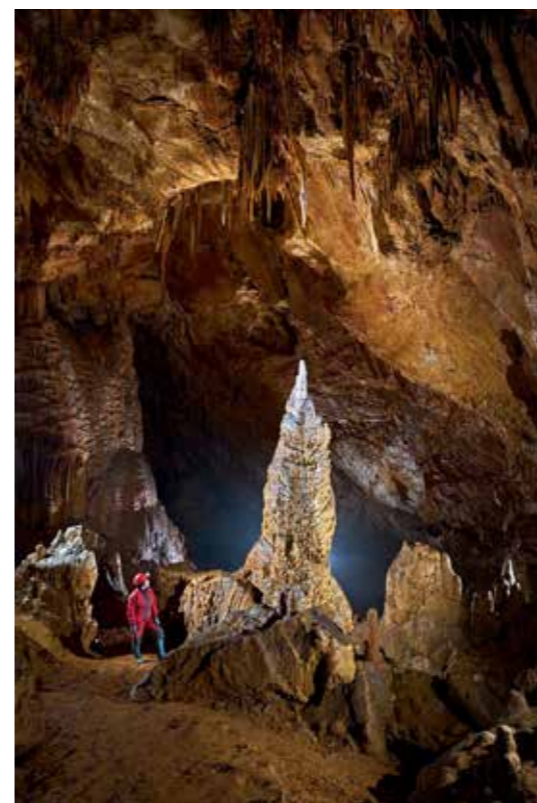
Tourist caves: Vilenica, Dimnice, Divača Cave