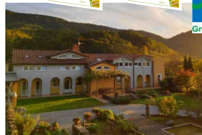
Hiša posebne sorte