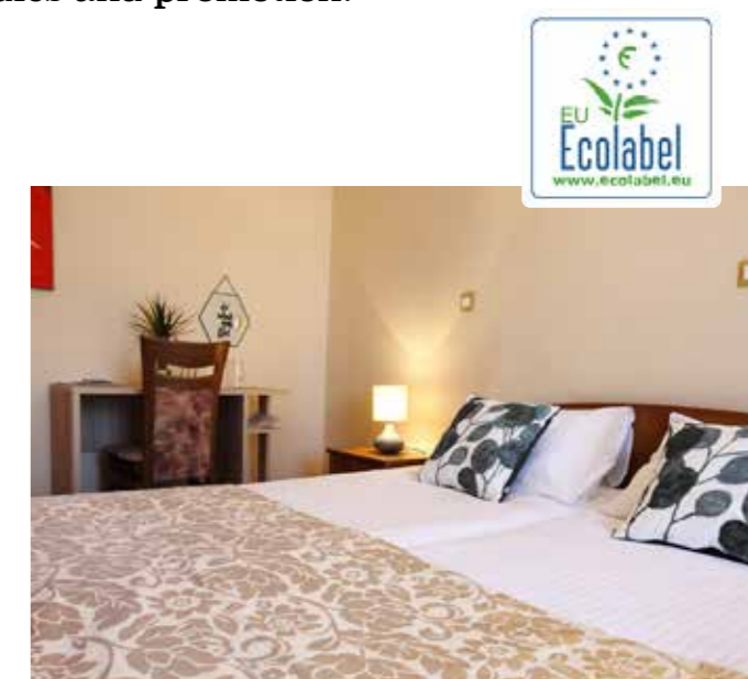
Gostišče Risnik s prenočišči