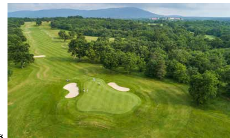
Lipica – pastures and forests