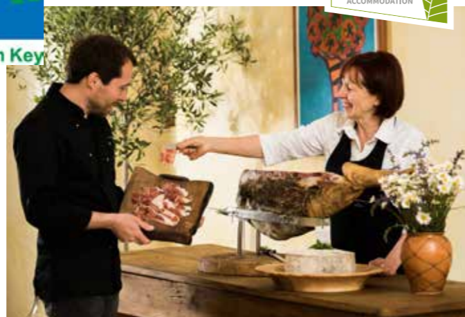
Špacapanova hiša Komen