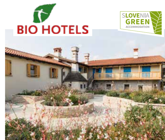
Hotel st. Daniel, Hruševica

The destination encourages providers to operate sustainably and obtain sustainability labels – through workshops, subsidies and promotion.