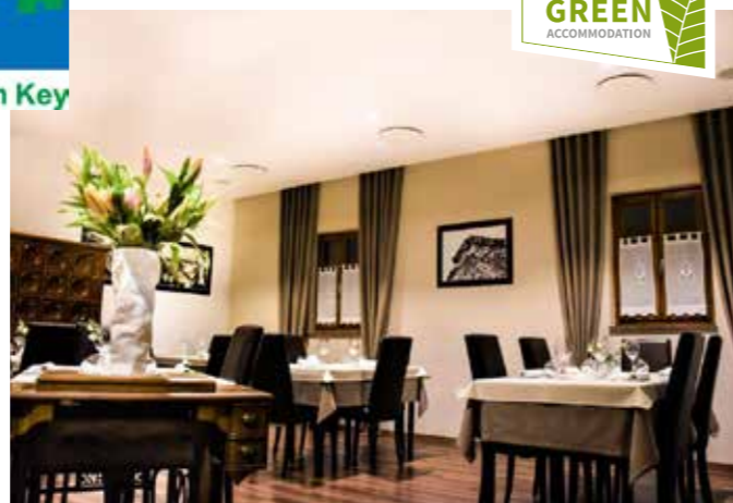
Gostilna Mahorčič, Rodik